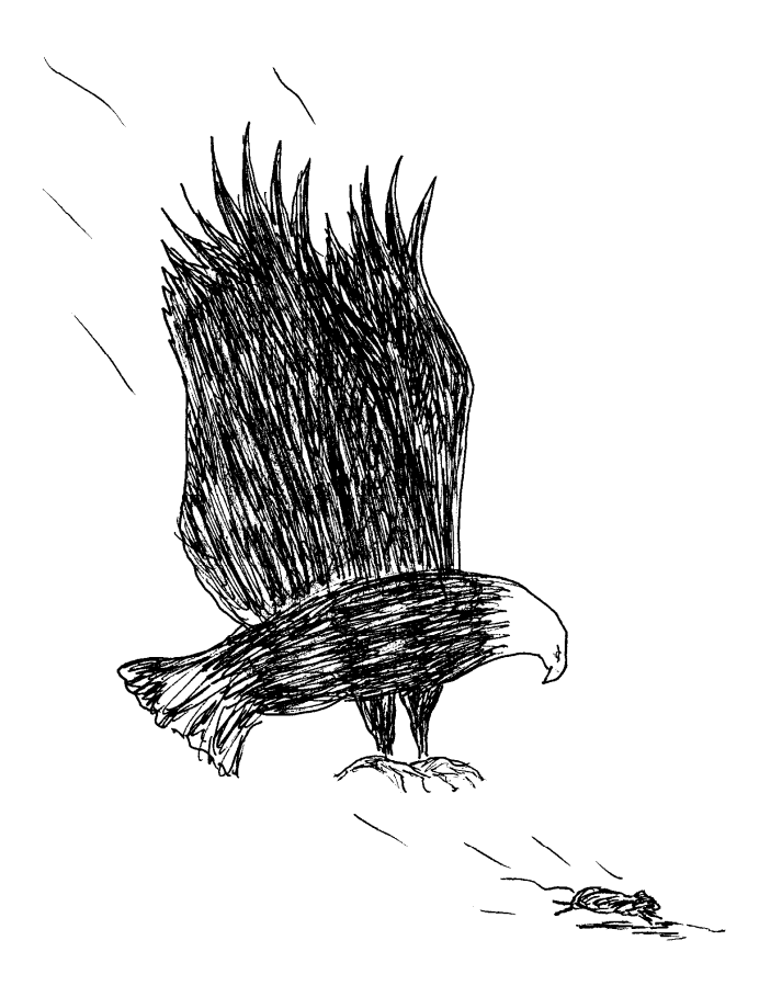
As Swift Ships or an Eagle

Job 9:25, 26 "...my days..." Vs. 26, "They are passed away as the swift ships: as the eagle that hasteth to the prey."